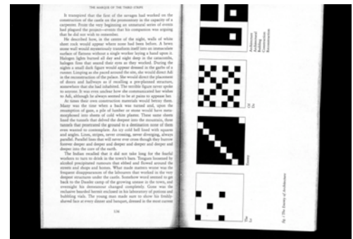
Alexandre Singh The Marque of the Third Stripe , 2008 Inkjet print, 108 cm x 138 cm, pages 136-137