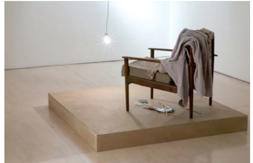
Clare Gasson, The Washaway Road , 2008 Sound piece, stage, chair and light