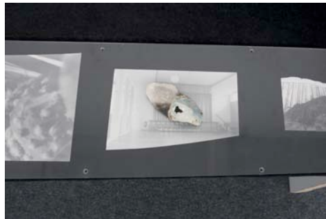
Reto Pulfer, Aquariumspiel in 128 Zuständen (PMG) (detail), 2007 Aquarium, wooden furniture, velvet, 4 pictures b/w, ceramic Variable size (ca. 65 cm x 80 cm x 70 cm)