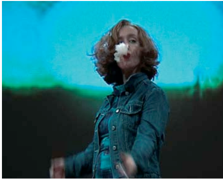
Orla Barry, Wideawake (still), 2003 Video, 25 min, colour

« À corps & à textes » La Galerie, Contemporary art centre Contact : Marjolaine Calipel T : +33 (0)1 49 42 67 17 marjolaine.calipel@noisyselec.fr